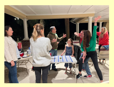
St Patty's Pot Luck Dinner